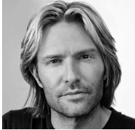
Eric Whitacre, Composer/ Conductor

Grammy-winning composer and conductor Eric Whitacre is one of the most popular musicians of our time. His concert music has been performed throughout the world by millions of amateur and professional musicians alike, while his ground-breaking Virtual Choirs have united singers from more than 110 different countries. A graduate of the prestigious Juilliard School of Music, Mr. Whitacre was recently appointed artist in residence with the Los Angeles Master Chorale having completed a five-year term as composer in residence at Sidney Sussex College, Cambridge University, UK.